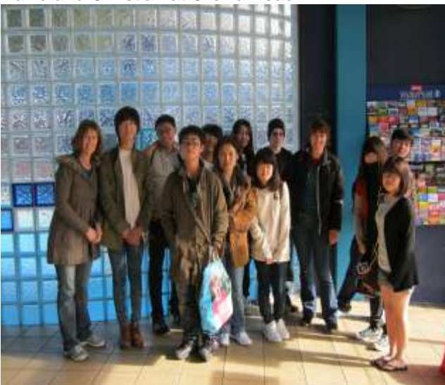
Ready for fun at Waiwera Hot Pools